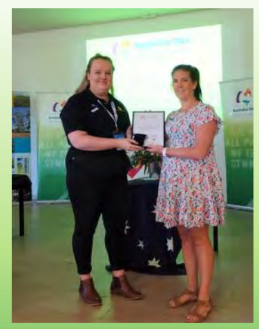
Corrigin P&C "Ladies Garden Day 2020"

NOMINATE NOW FOR 2022 AWARDS <u>www.citizenoftheyear.com.au/nominate</u>