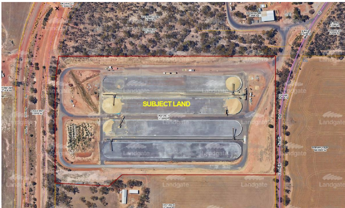
Location & Lot Configuration Plan

The land has direct frontage and access to Corrigin South Road and Walton Street along its eastern boundary, both of which are sealed and drained local roads under the care, control and management of the Shire of Corrigin.