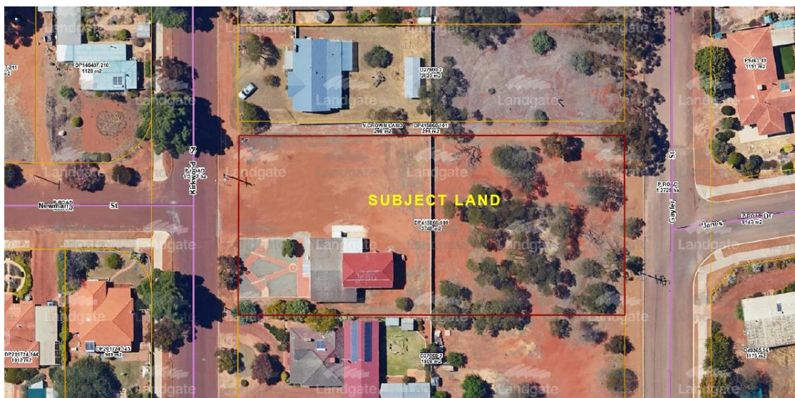
Location & Lot Configuration Plan

The subject land has been developed and used for community purposes (i.e. a Masonic Lodge) since 1927 and contains a large hall building in its western half constructed using cream coloured bricks with a red brick foundation and a red corrugated iron roof. The eastern half of the property is currently vacant and not being used for any specific approved purpose/s.