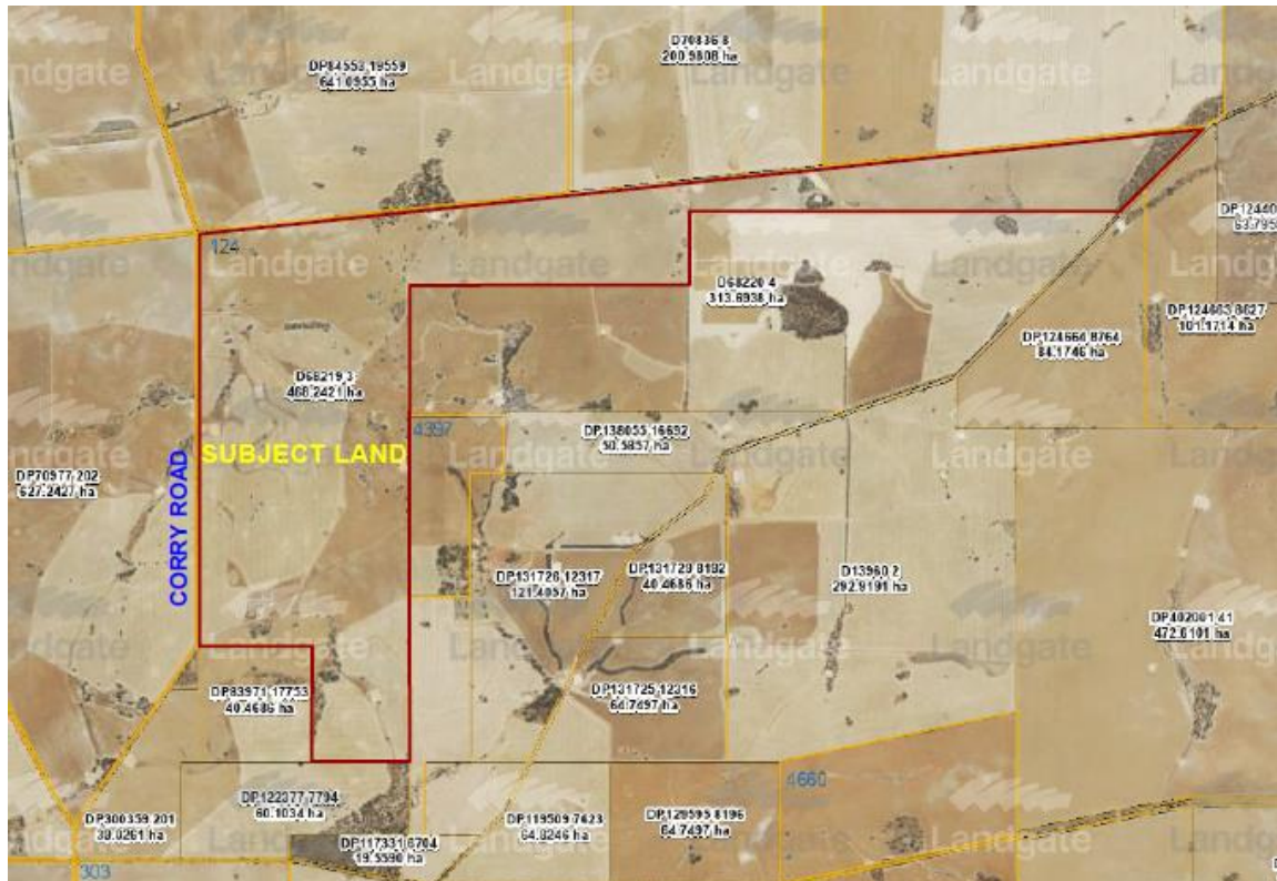
Location Plan