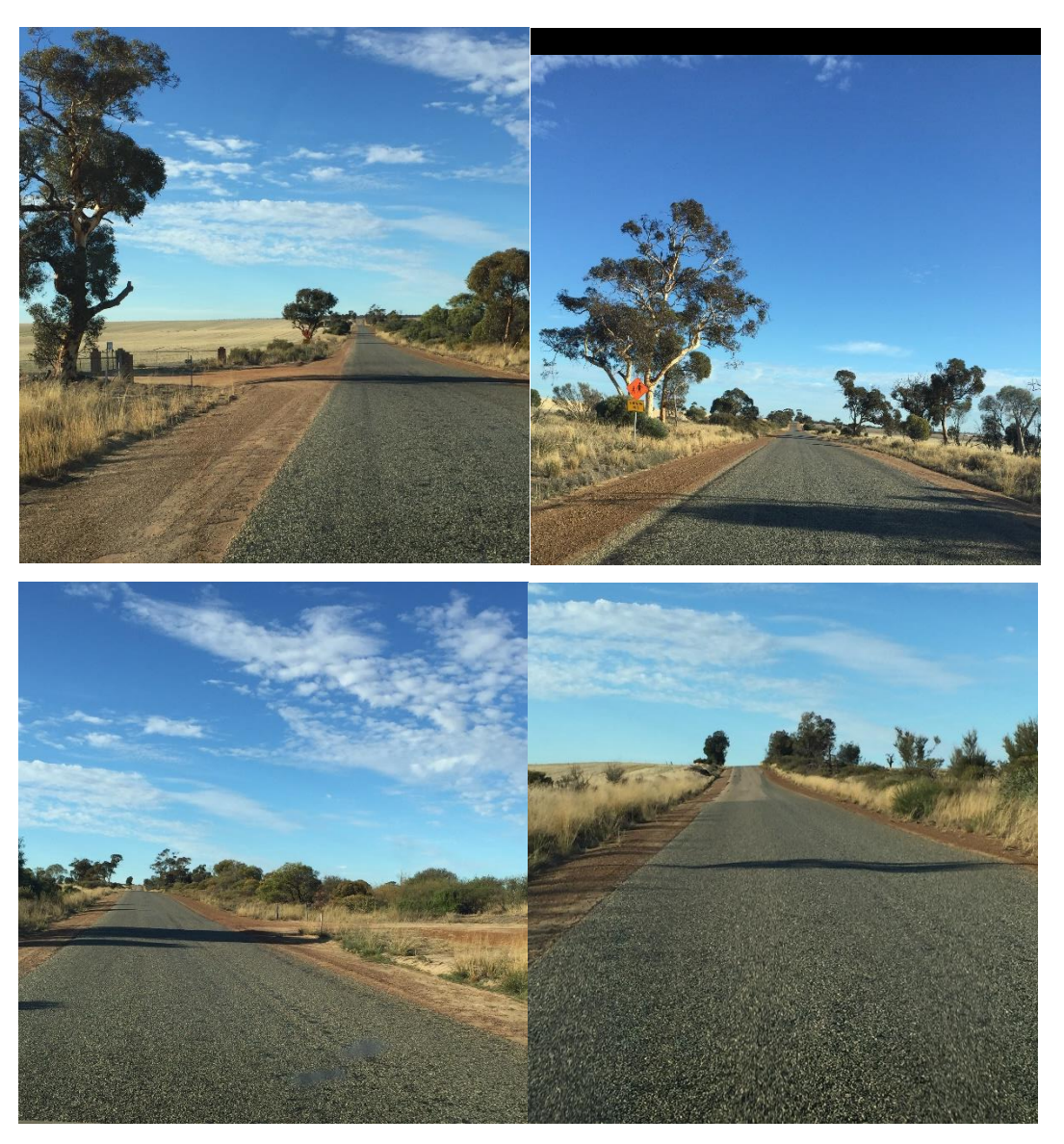
SLK 8.245 to 13.950

A summary of the existing road conditions for the applicable sections is outlined below.