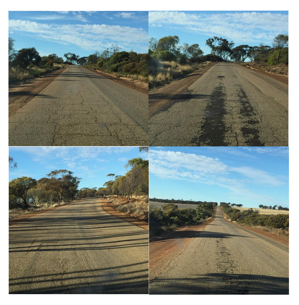
SLK 13.950 to 14.950

Bitumen surface 6m wide with varying width gravel shoulders extending through left/right horizontal curves.