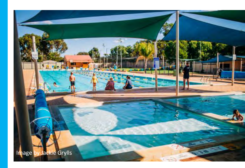
PLEASE NOTE: Times are subject to change depending on weather. Like the Shire of Corrigin Facebook Page for the latest pool updates.