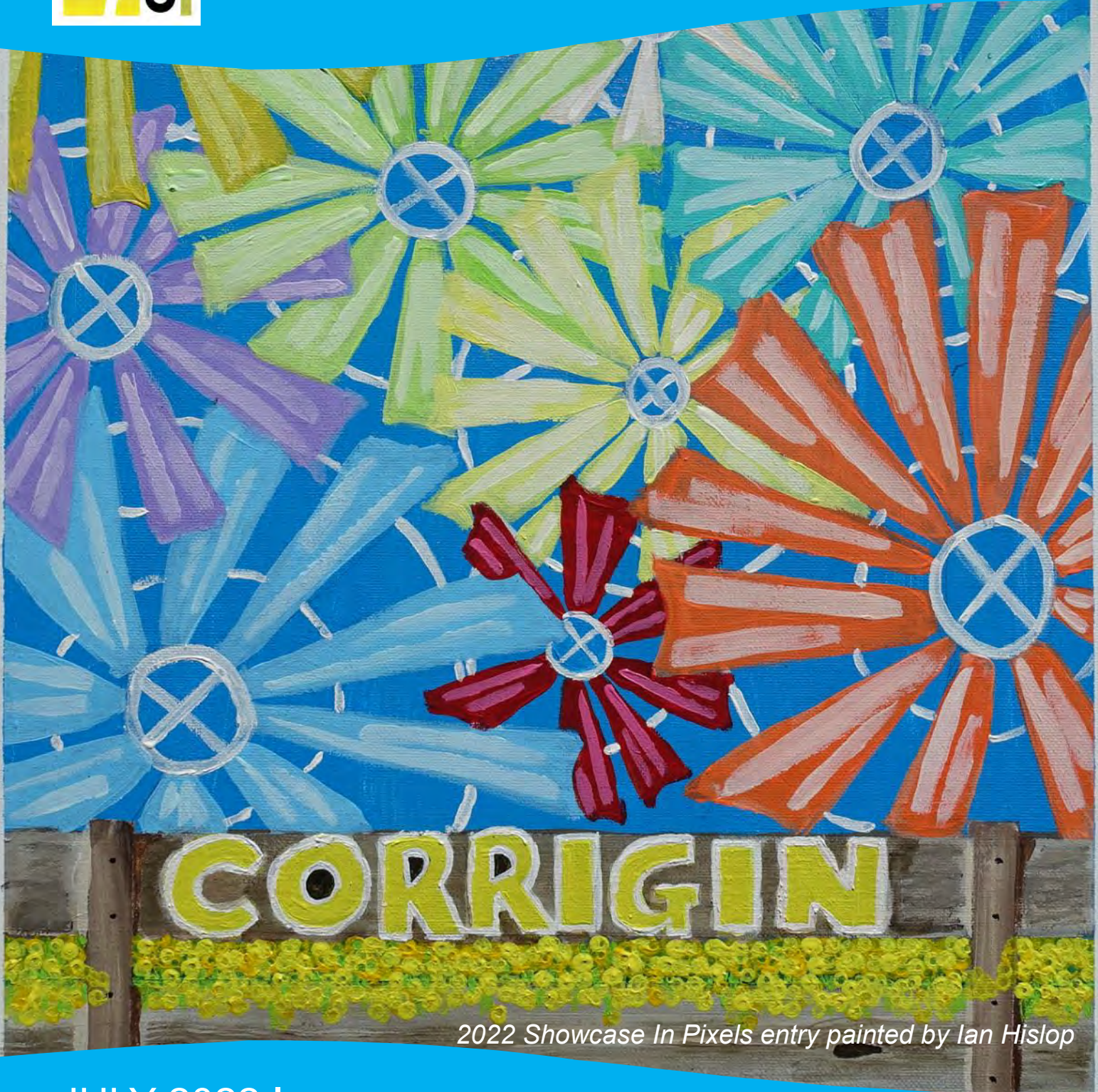
2022 Showcase In Pixels entry painted by Ian Hislop