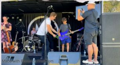
Made with Pixabay.com