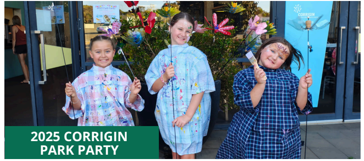
2025 CORRIGIN PARK PARTY

Thank you to the Corrigin Rotary Club for their BBQ expertise, breakfast was delicious!