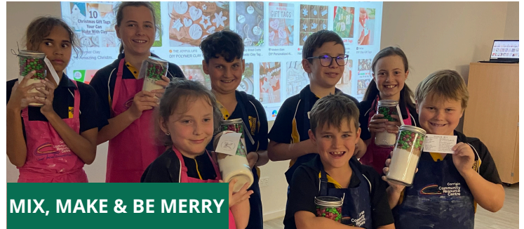
MIX, MAKE & BE MERRY

A huge thank you to our generous sponsors, hardworking vendors, dedicated volunteers, and everyone who came along to make the evening so special.