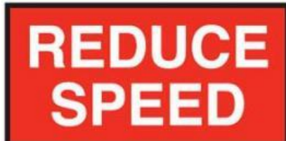
Reduce Speed sign