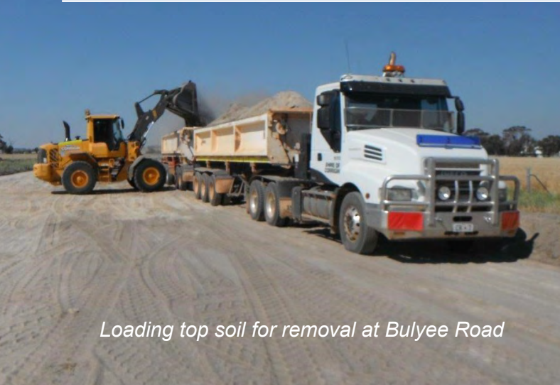
Loading top soil for removal at Bulyee Road