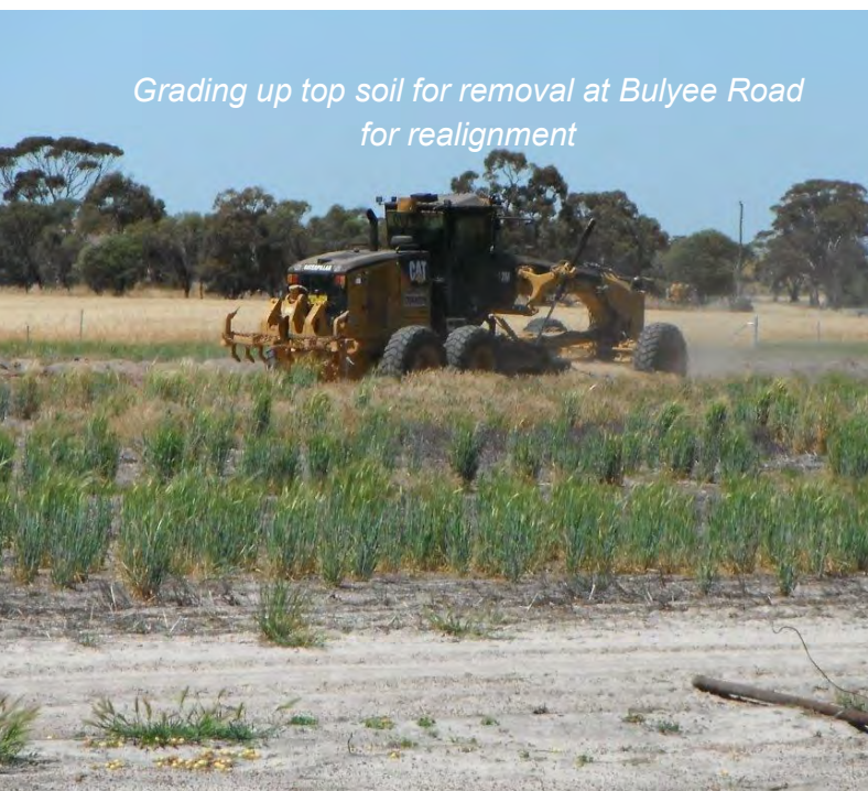
Grading up top soil for removal at Bulyee Road for realignment