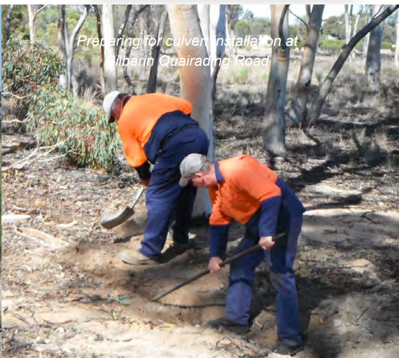
Preparing for culvert installation at Bilbarin Quairading Road