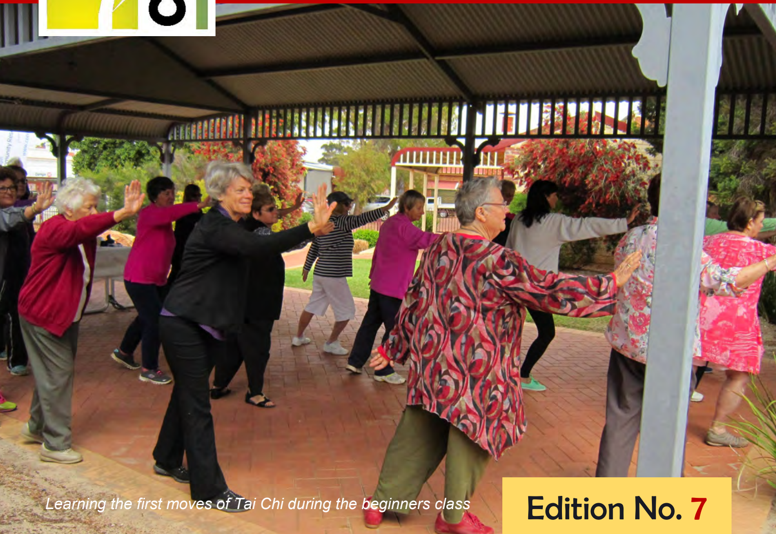
Learning the first moves of Tai Chi during the beginners class

Keeping the Corrigin community informed and involved