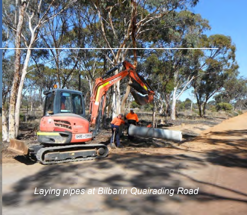
Laying pipes at Bilbarin Quairading Road