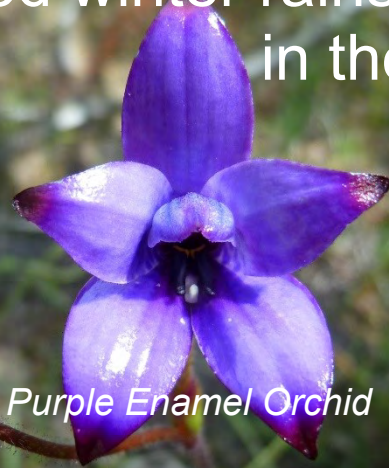
Purple Enamel Orchid