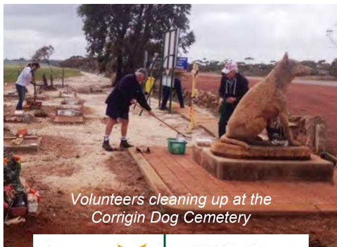
Volunteers cleaning up at the Corrigin Dog Cemetery

Next Meeting: Monday 17th Oct 7.00pm at CWA Hall