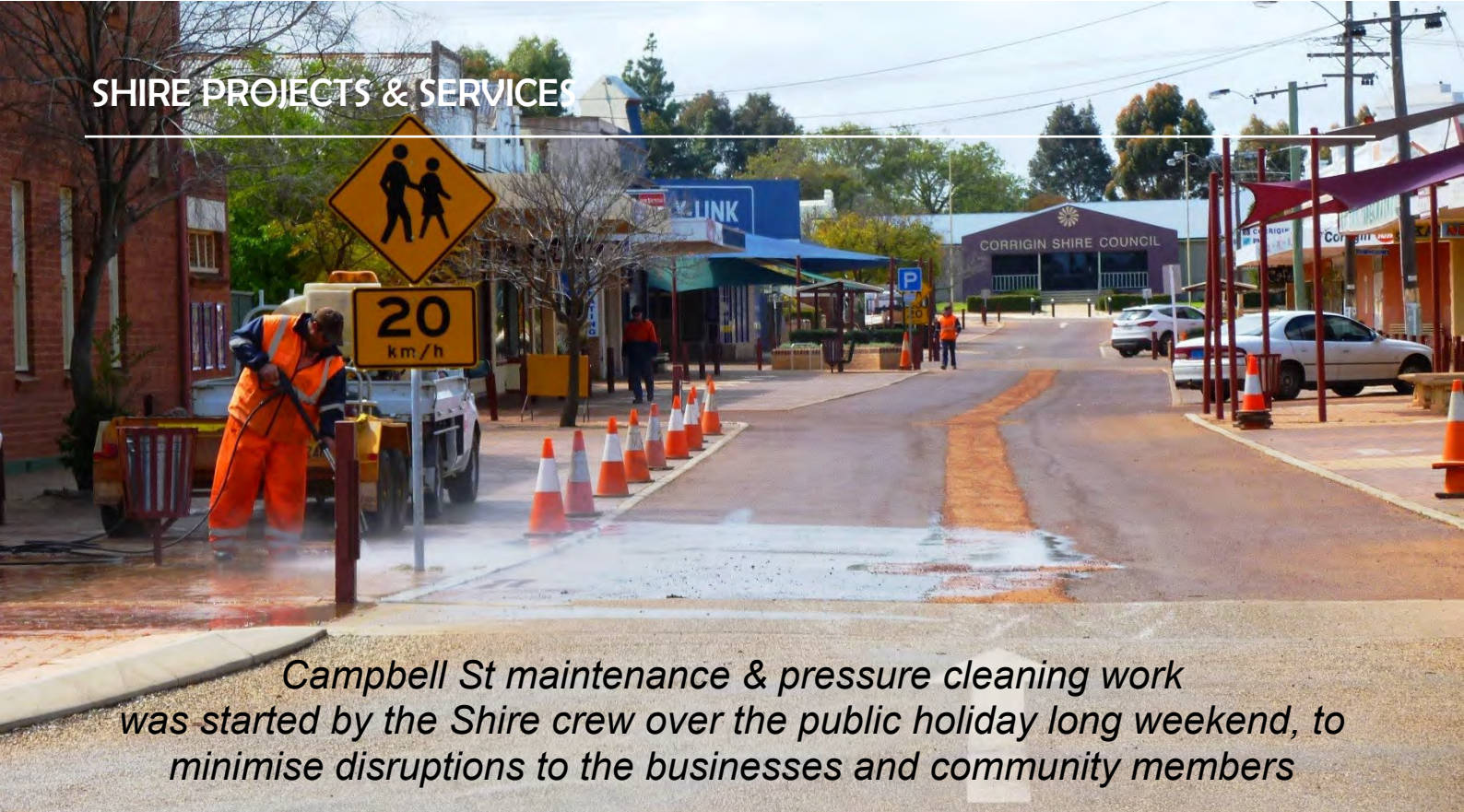
Campbell St maintenance & pressure cleaning work was started by the Shire crew over the public holiday long weekend, to minimise disruptions to the businesses and community members