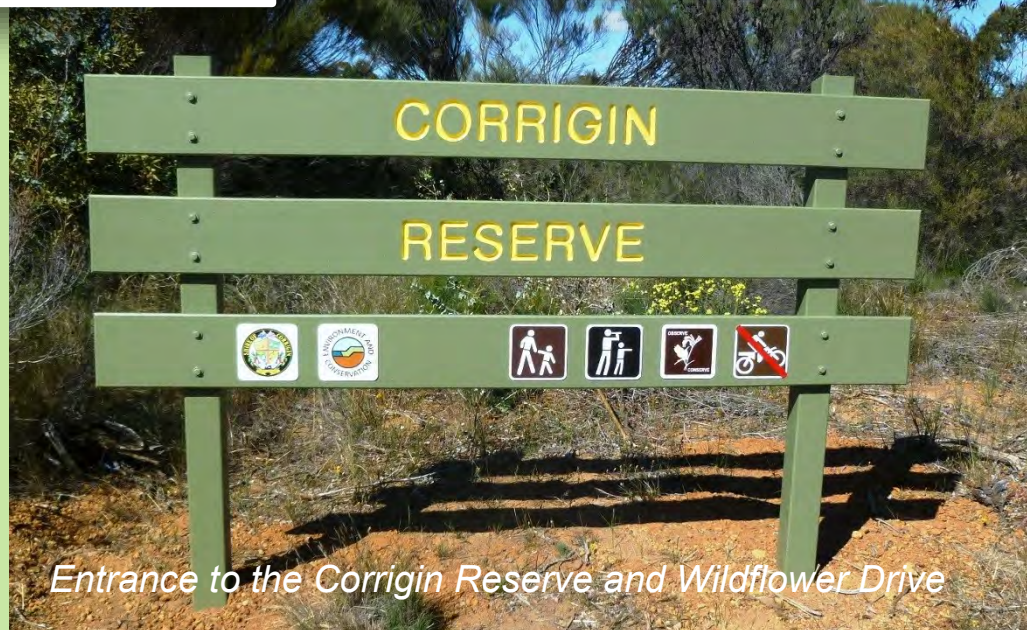
Entrance to the Corrigin Reserve and Wildflower Drive

Call into the Corrigin CRC and pick-up a brochure about the Corrigin Wildflower Drive, it's worth a look.