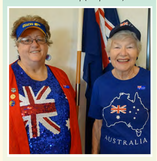
Take a look at more photos of the Corrigin Australia Day 2020 event, on the Shire of Corrigin Facebook page