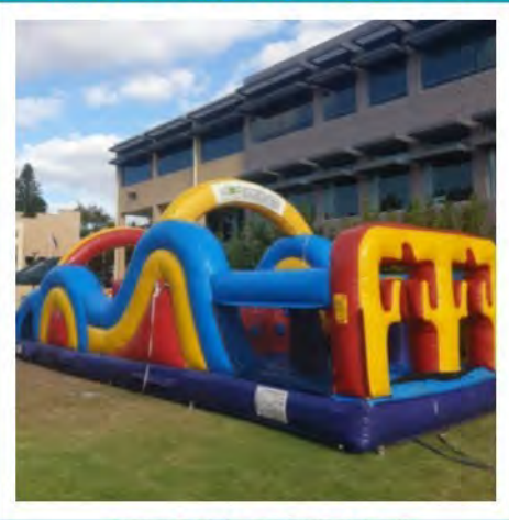
SAMOURI OBSTACLE COURSE COURT