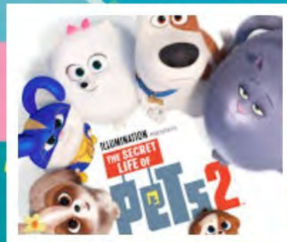
OUTDOOR MOVIE - SECRET LIFE OF PETS 2