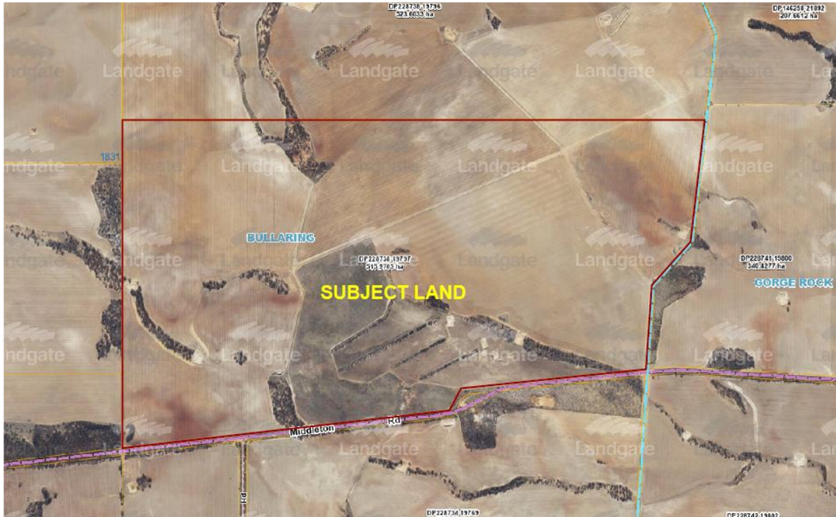
Location Plan

Existing adjoining and other nearby land uses are predominantly rural in nature (i.e. broadacre cropping and grazing) on lots ranging in size from 64 to 809 hectares.