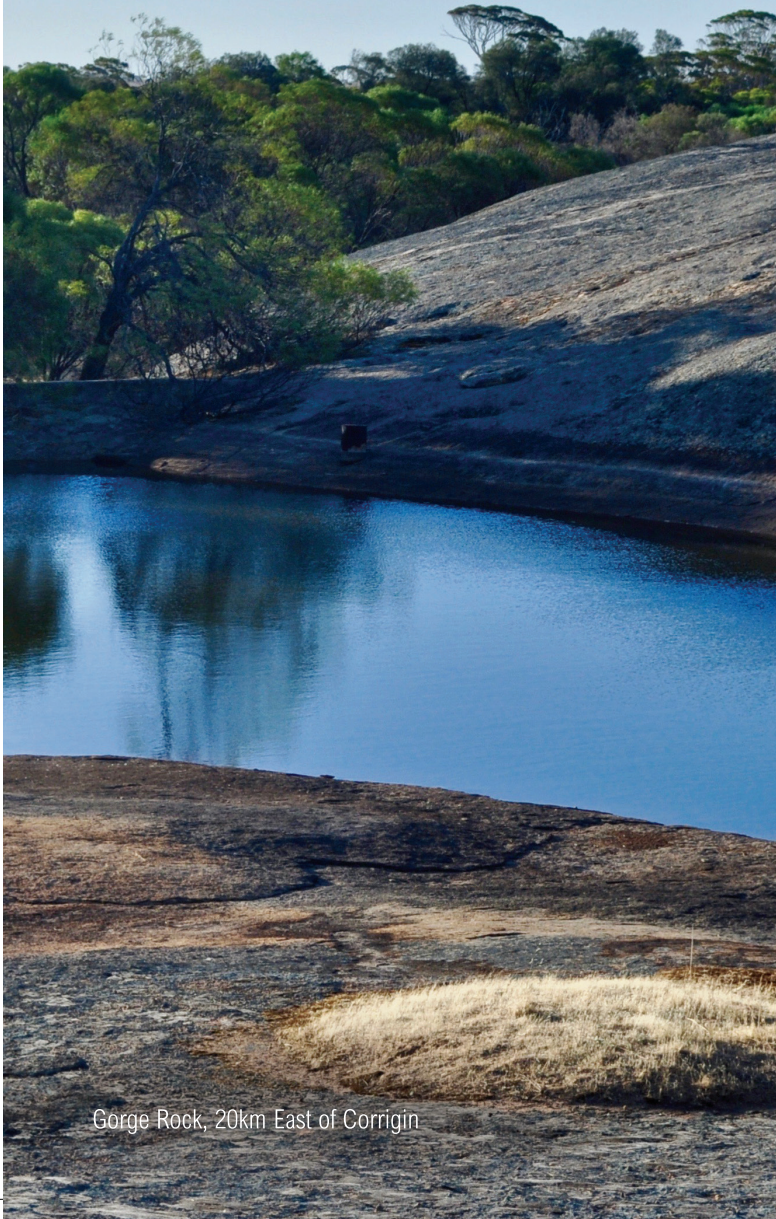
Gorge Rock, 20km East of Corrigin

Corrigin is only 235km south-east of Perth, on the Brookton Highway. Situated in the Central Wheatbelt, the area is predominately a farming community with friendly locals.